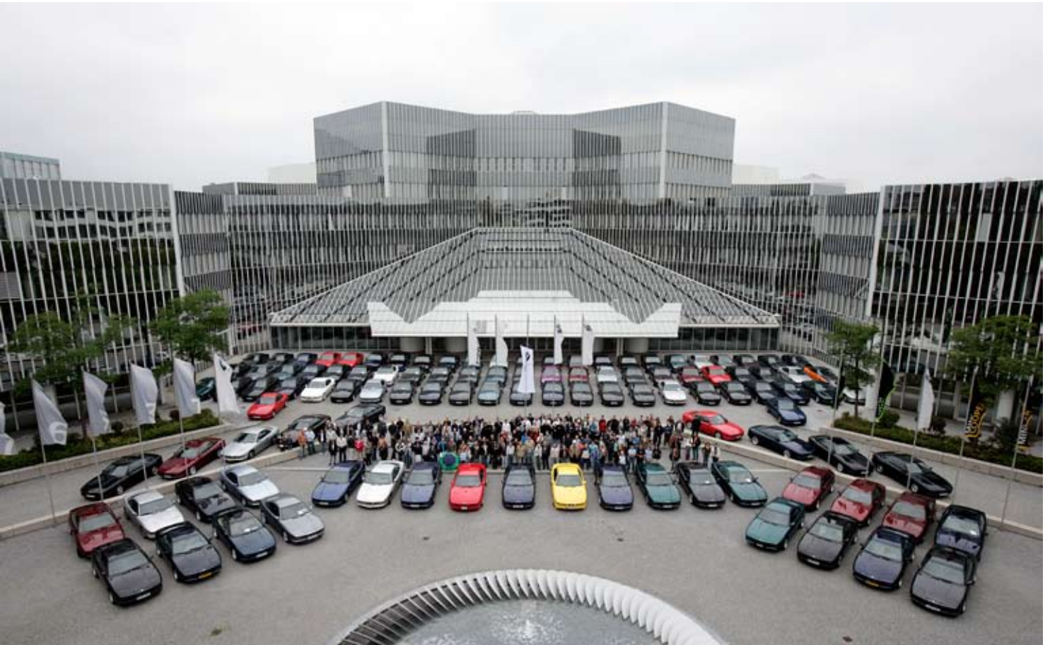
Nearly 200 attendees with their beloved 8 Series vehicles in front of the BMW Group Research and Innovation Center

Newsletter of the International Council of BMW Clubs