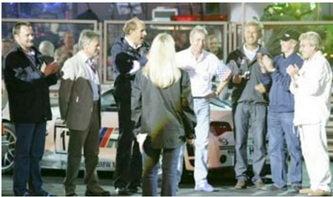
Celebrities and M Experts in the Pit Lane Park