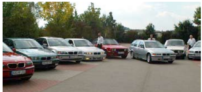
Part of today's club

young and old, singles and families, old and new BMW vehicles are represented and are indeed always welcome. The BMW Club is of course open to all motorcyclists, too. Club life has many different faces. It starts with the monthly club evening where particular importance is attached to spending fun time together and maintaining friendships. Then members are offered tourist excursions, both locally and further afield, including hikes, excursions lasting several days at home and abroad and participation in the international meetings of the BMW Clubs. Barbecues, bowling afternoons, a Christmas party and much more round off the club's annual program of events. So this is not a brand club or a motor racing club – it is first and foremost a club for the whole family and for all BMW enthusiasts. The motto for all those interested is: "Come as a guest and stay as a friend."