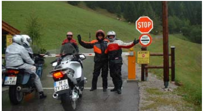
Automatic toll booth