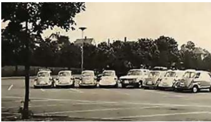
How everything began in 1957

At the beginning of 1957 a small group of Isetta enthusiasts from the area of Gmünd met to spend their leisure time together with their cars. In September of that year the Isetta Club Schwäbisch Gmünd was founded.