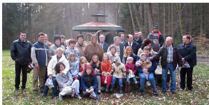
Club members at one of the many collective activities

Later, the first BMW 600 and 700 models joined, and it was felt that the club name should be changed to BMW Club Schwäbisch Gmünd. Although there is one BMW Club which was founded earlier, the BMW Club Düsseldorf 1928 e.V., this was only a motorcycle club, so the BMW Club Schwäbisch Gmünd is the world's oldest automobile club in the blue and white club family – another reason for the Gmünd club to be proud, in addition to celebrating its anniversary.