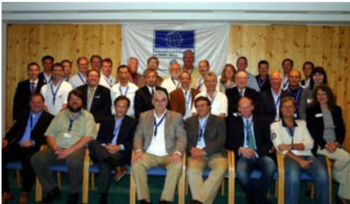
Attendees of the International Council Meeting 2007

The occasion was the Annual Meeting of the International Council of BMW Clubs. Motorcycles were represented by the BMW Motorcycle Owners of America, BMW Riders Association, BMW Clubs Asia, BMW Clubs Europe, BMW Clubs Africa and the newly formed Federation of European BMW Clubs. Planning started months before – when the invitations that went out asked whether there would be an interest in an organised ride during the meeting, and it received a resounding Yes from all attendees.