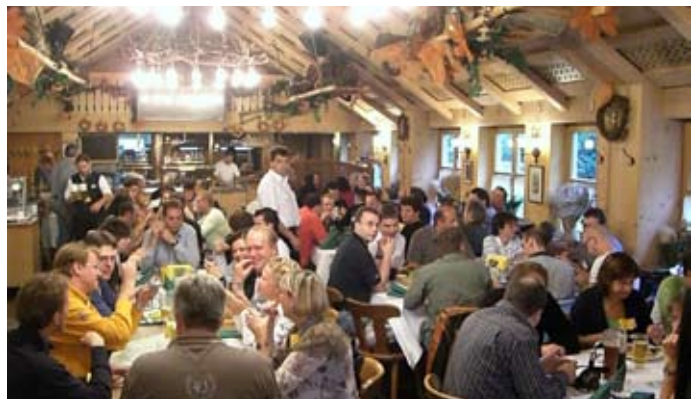
Cozy get-together in the Hirschgarten Munich