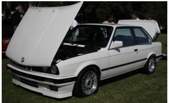
Judging in the concours

the course, and penalties were added for cones that were hit. The competition was fierce, but fun. Attendees gathered back at the hotel on Monday evening for the reception sponsored by the vendors who displayed their goods and services. On Tuesday evening, the Michelin reception honored the BMW E30 M3. The BMW CCA Foundation ran their Street Survival School on Wednesday, sponsored by the Tire Rack and Michelin. This program, now nationwide, teaches teen drivers how to better cope with the dangers of everyday driving by training them in car control, judgment, and emergency situation responses. The festivities moved to Billy Bob's Texas honky tonk on Wednesday night, featuring a barbeque sponsored by Autobahn Motorcar Group of Fort Worth. Highlights included line dancing and riding the mechanical bull. For the precision drivers, Thursday was the Time, Speed, Distance Rally. Forty-six teams took to the Texas roads, pitting their driving and mathematical skills against the rally master's perfect time. Judging in the concours began Friday morning, with cars displayed on the Kimball Art Museum's beautiful lawn. Sponsored by Griot's Garage, the event drew gorgeous examples of BMW vehicles including a 1958 Isetta, 1967 BMW 1600, and a variety of BMW coupés, sedans, roadsters, and M cars.