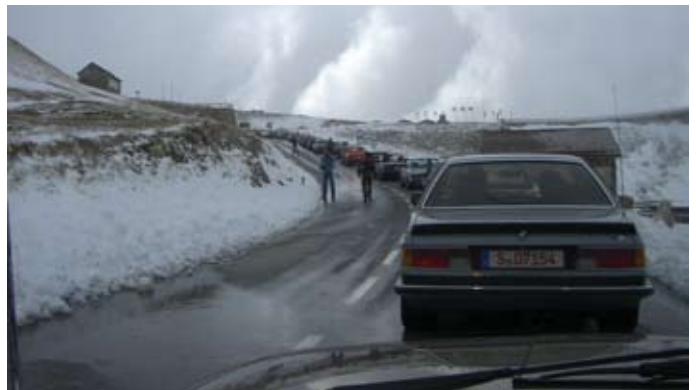
Drive-up to the snow-covered Großglockner