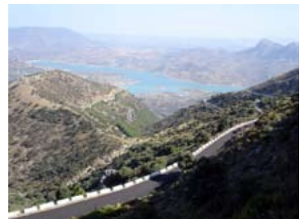
Wonderful motorcycle routes in Andalusia