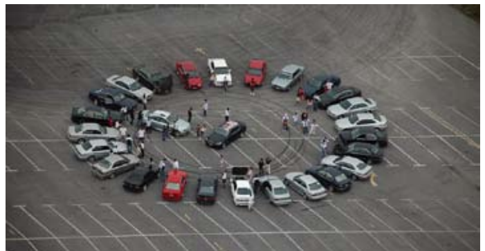
A bird's eye view of the 5 Series gang