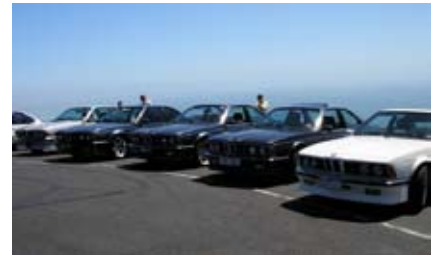
M-powered cars from BMW Car Club of Victoria at Arthur's Seat.

You will also find a current calendar of events on our website at www.bmw-clubs-international.com