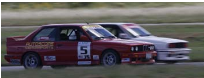
Sprint race during CCA Racing weekend at Texas Motorsport Ranch

The BMW Car Club of America's annual Oktoberfest is a celebration of all things BMW. This year's event was from September 29 th to October 5 th in historic Fort Worth, Texas, a former wild west cow town that has grown into a cosmopolitan center of art and entertainment. The honored BMW for Oktoberfest 2007 was the BMW E30 M3, so it was appropriate that a BMW E30 M3 scored overall wins in two sprint races during the BMW CCA Club Racing weekend at Texas Motorsport Ranch.