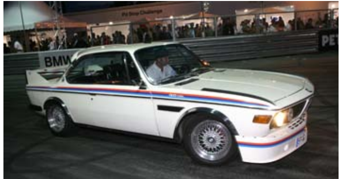
“Hand CSL” drives into the Pit Lane Park