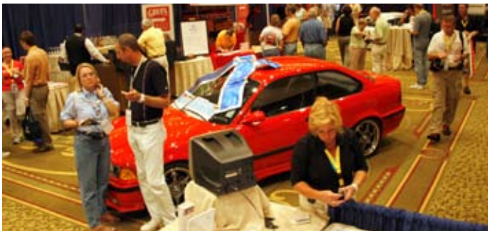
BMW CCA Oktoberfest 2007

Later on Sunday evening, the Opening Reception at the Fort Worth Hilton brought together hundreds of BMW CCA members, vendors, and sponsors. Throughout Oktoberfest, after each day's driving events, participants gathered for a reception or dinner, to socialize, discuss the day's activities, and most importantly, meet with old friends and make new ones.