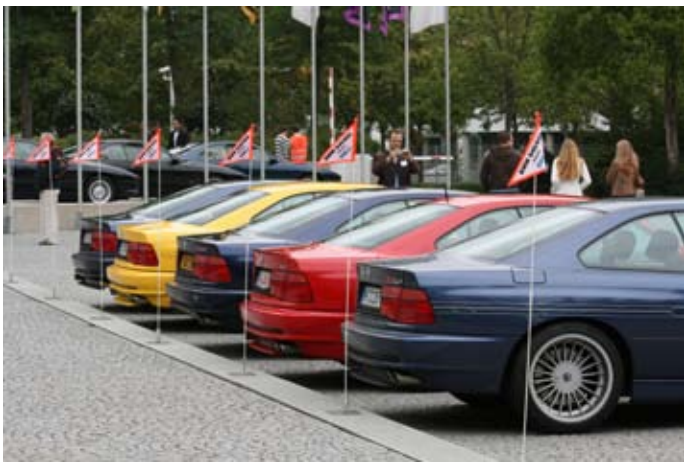
Colorful line-up of 8 Series vehicles