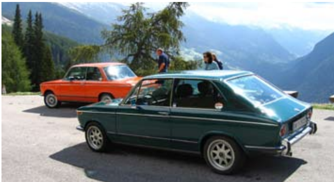
BMW 02 and 02 Touring in the sunny province of Carinthia

From September 2 nd – 9 th , BMW classic cars of all types came together for the first time for a very special event in Kaprun/ Salzburg: it was planned as a late summer vacation week amid the Alps with sunshine, a blue sky and warm weather – a chance to get to know drivers of other BMW models. However, things in fact turned out quite differently, at least in terms of the weather. While the weather on the weekend and on Monday was in line with expectations, the Tuesday was anything but: a sudden burst of winter put the organizers and teams to the test. All in all, 50 teams with their BMW and GLAS vehicles enjoyed an exciting and unusual programme.